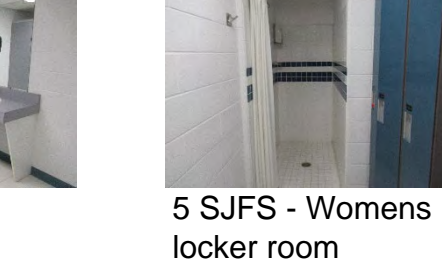
5 SJFS - Womens 6 SJFS - Mens washroom toilet area